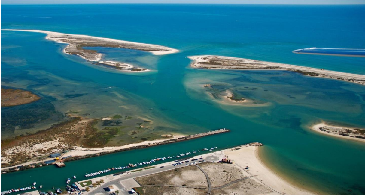
Fuseta Beach.