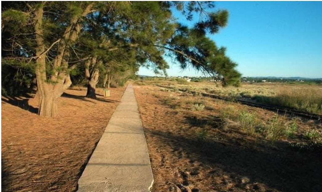
Path of Praia do Barril .

This trail, about 3km, allows you to reach the ocean by crossing the Ria Formosa Nature Reserve. You can also discover the anchor cemetery. It is a beautiful walk that can be done partly by small train that runs along the path.