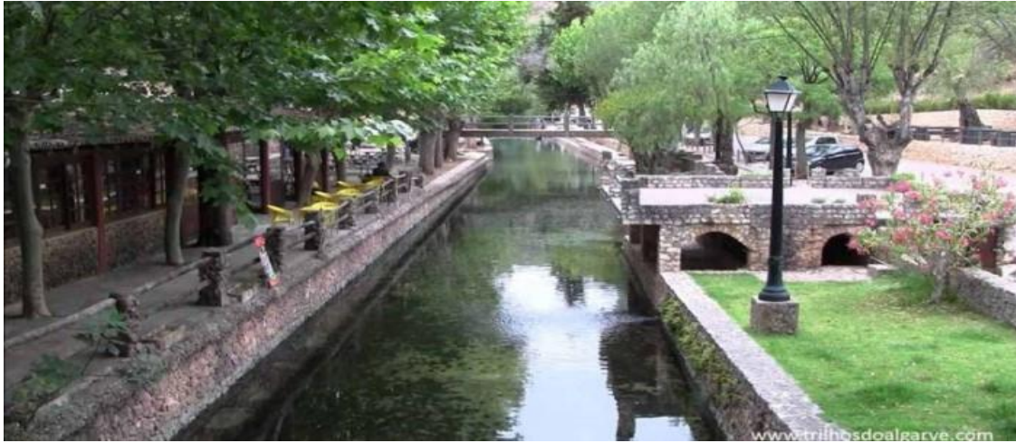
The village of Alte. Photo of Região Sul .