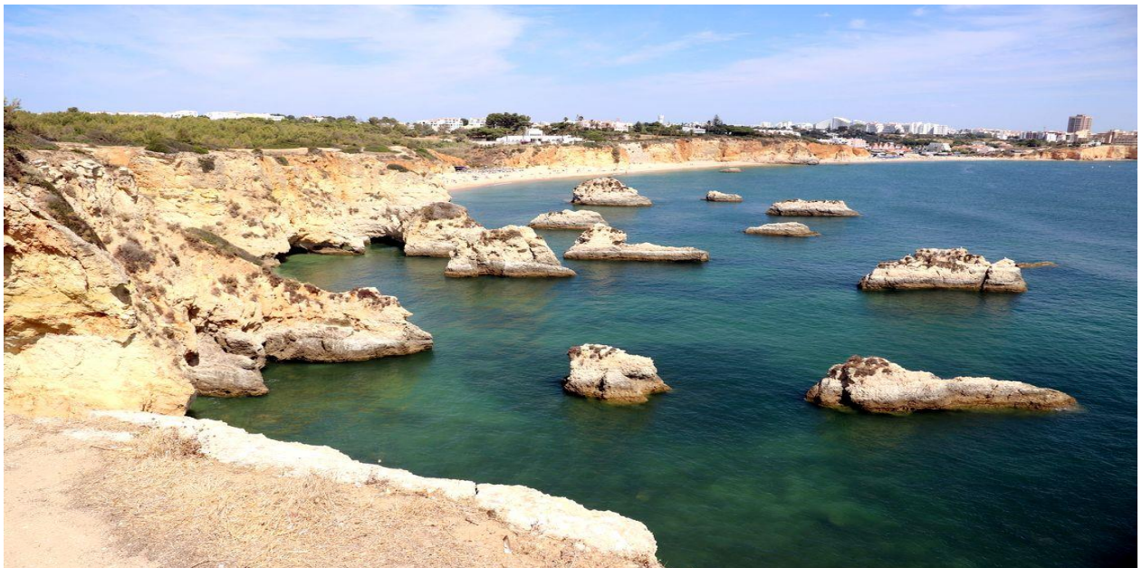
Du côté de Lagos Cabo São Vicente, près de Sagres