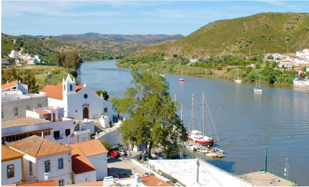
Alcoutim. Photo of Visit Portugal .