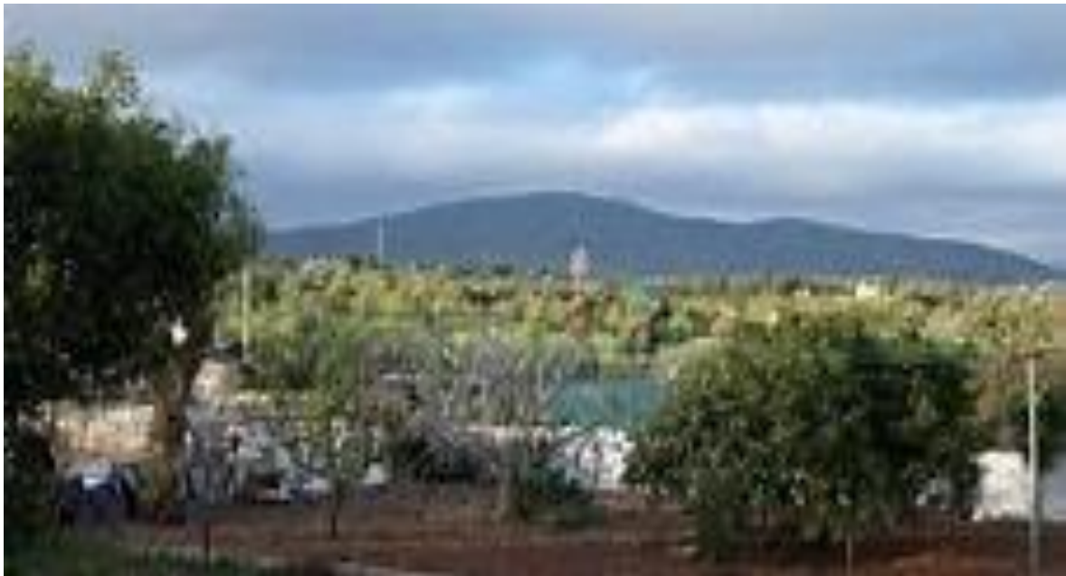
Le Cerro de Sao Miguel

There is also Le Cerro de Sao Miguel ... The departure is from Moncarapacho towards the antenna of Sao Miguel ... A magnificent view of the whole region (about 90 kms of coast) and also the mountainous hinterland, easily accessible by car and the ascent on foot is feasible in a good hour ... Many trails and mountain bike trails climb to the summit at 400m altitude (To get there, just find the small road that starts from the one that connects Moncarapacho to the A22 motorway).