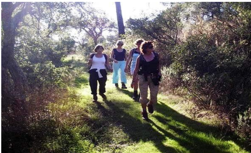
Serra de Monchique

The Serra de Monchique (Monchique Mountain) rises above the sea and hides some of the most beautiful trails in the Algarve. With different flora and fauna than the coast and magnificent freshwater waterfalls, you will find a magical walk during which you can discover some of the best kept secrets of the region. The Monchique hike is 11 kilometers long and is done in three hours, it includes a visit to the village of Monchique, which has a church dating back to the 11th century, a typical Portuguese market and street.