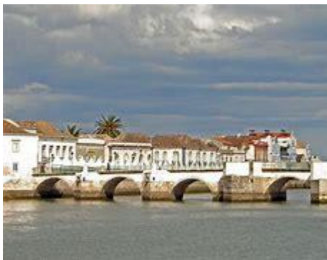
The Roman bridge

Cachopo: A valley of hills between Monacrapcho and Tavira to do by car (From Tavira, after the bridge turn left towards Cachopo and then it is a walk to do by car 40 kms in the valley of CACHOPO ... The most beautiful period to do this walk is at the end of April – May – June, after it is too hot and nature is too dry)