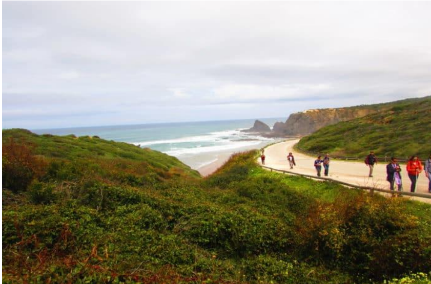
Hiking on the west coast.