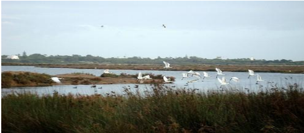
Hiking bird watching.

This is a great hike for bird watching that also gives you the opportunity to explore the Ludo and Quinta do Lago areas.