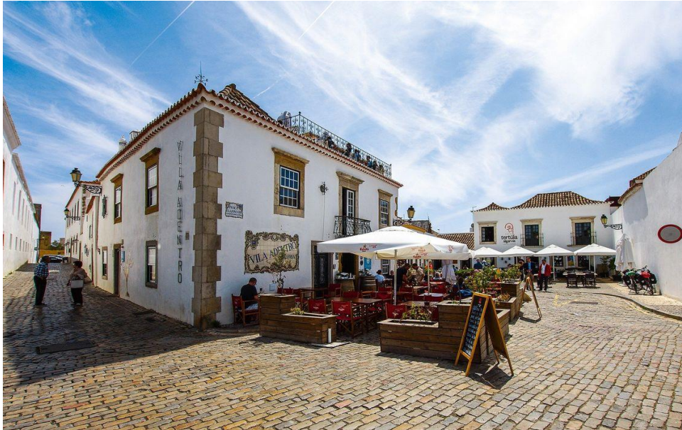
Historic Centre of Faro

Portuguese until 1239 with D. Afonso III. Due to its privileged geographical location and safe haven, Faro became a prosperous city during the Portuguese discoveries.