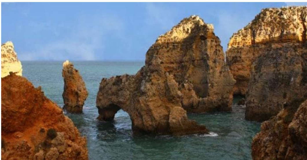
Ponta Piedade to Lagos.

Ponta da Piedade is one of the most beautiful areas of Lagos due to its wind-eroded rock formations and translucent waters. Covering about 5 kilometers in total (round trip), this trail will show you the light and color show that takes place there, as well as its mysterious caves and natural tunnels. Stroll along the vertiginous cliffs of this trail and let yourself be seduced by the breathtaking views.