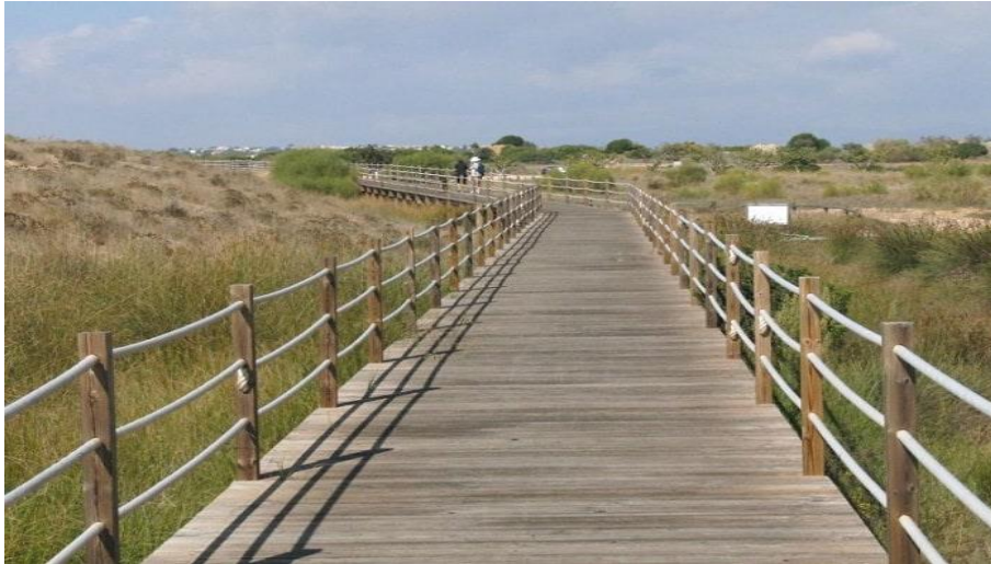
Salgados Promenade .