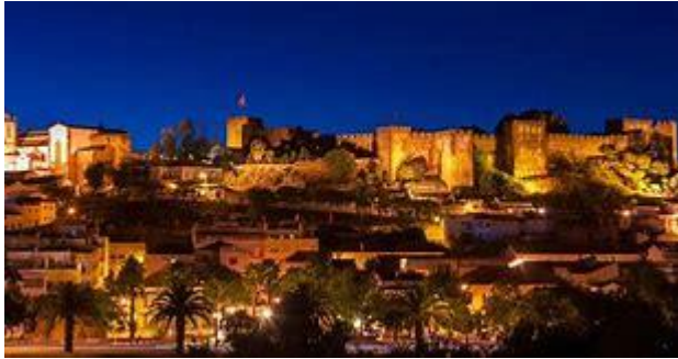
The castle fortress and the ramparts