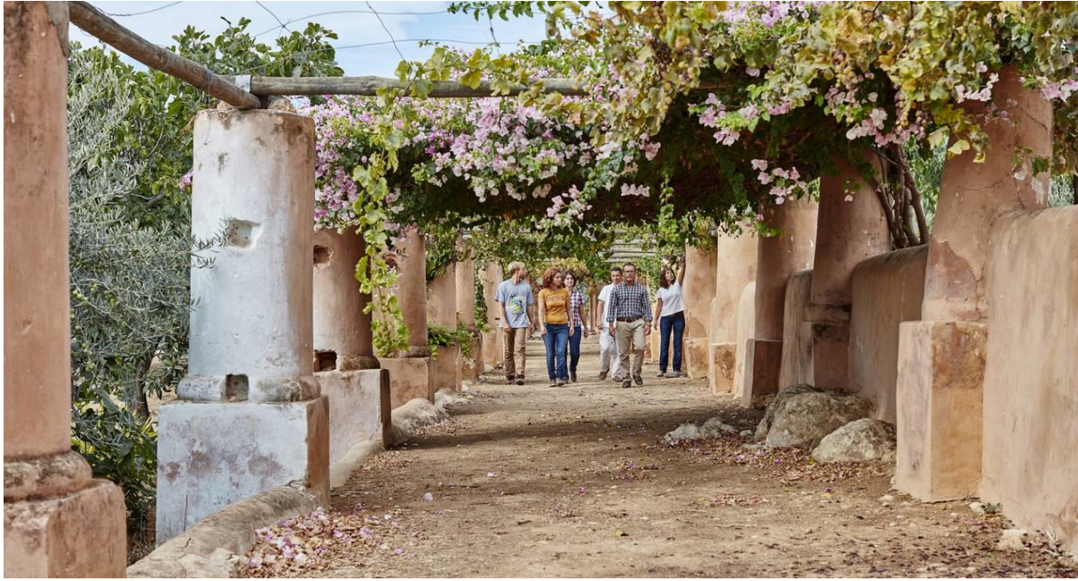
In Moncarapacho: OCTANT Vila Monte. 5-star hotel where it is sometimes possible to walk in this area