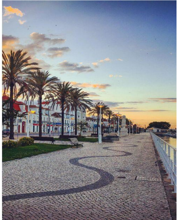
The gauche, Tavira. A droite, Vila Real de Santo António.